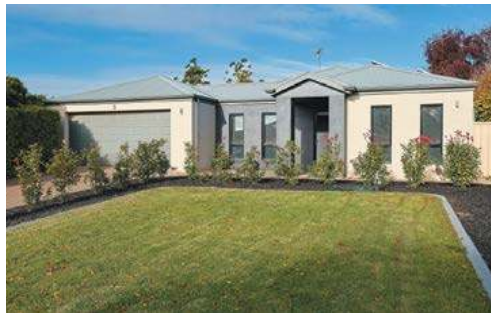
3 Stamford Court, Buronga

Price $145,000 - $155,000 Viewing Phone for Information Contact Tom Dawe 0455 400 382