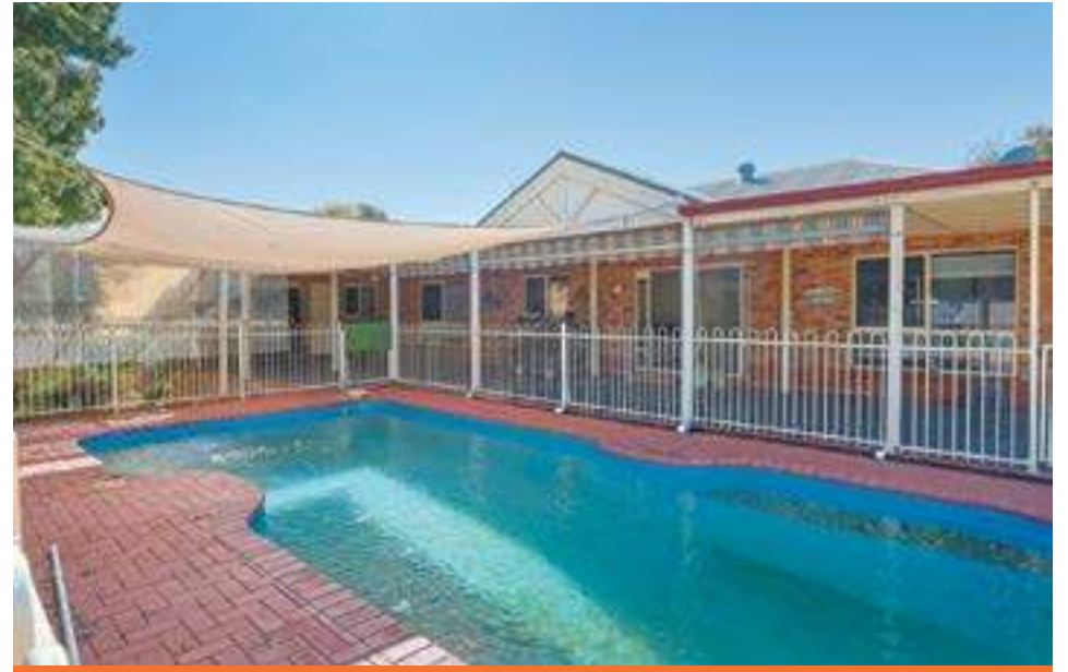
33 Golden Ash Drive, Mildura