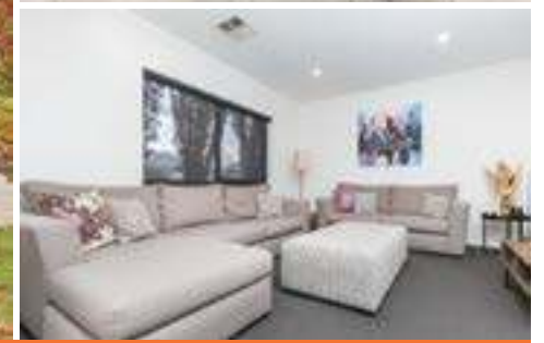
1/13 Springfield Drive, Mildura