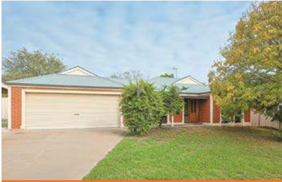
3 Tyers Court, Merbein