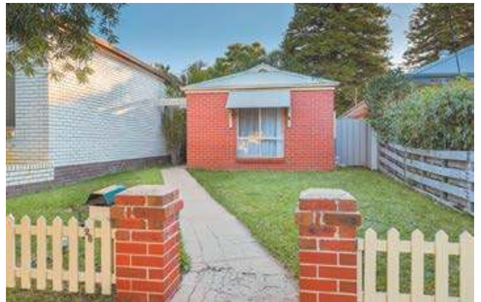
26 Heath Street, Red Cliffs