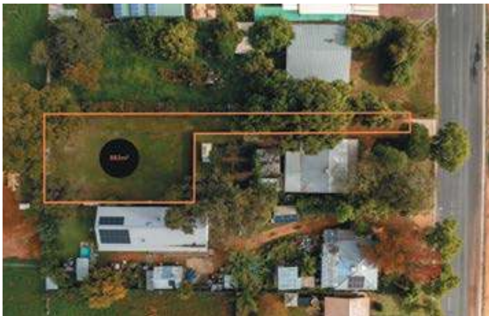
Lot 2, 56 Pitman Avenue, Buronga

Price $550,000 - $605,000 Viewing Sat 6th June, 9:00am - 9:30am Contact Tom Dawe 0455 400 382