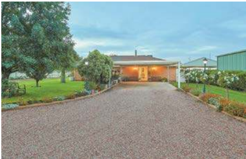
183 Boobook Avenue, Red Cliffs