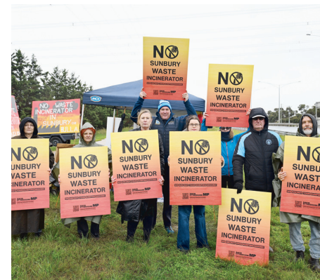
No Sunbury Waste Incinerator group held a public vigil. (Damjan Janevski) 561346_02

"We're going to keep protesting. We're going to keep doing other actions, and we're going to keep going until this is no longer a threat to our town."