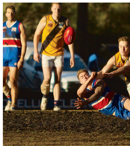
The light fades at Joe Brown Reserve. 563559_01