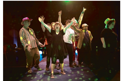
A performance of Meet Me at the Disco.

Glimmer will help activate Artrise with three performances slated for International Day of People with a Disability, in a performance aided by a $15,000 grant from