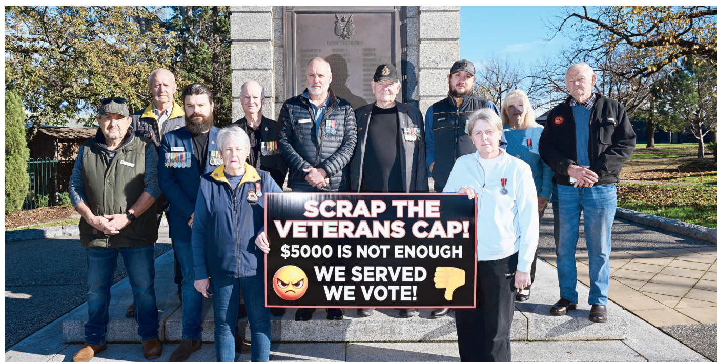
The Sunbury RSL Sub-Branch is opposed to the federal government's proposed budget cuts, 560997_01

The trial is set for 17 July for a one-day hearing.