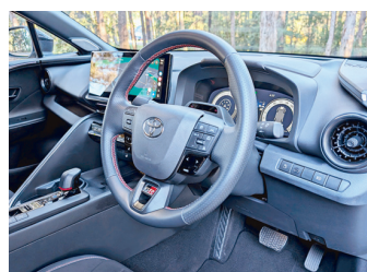
The previous 1.8-litre hybrid has been replaced by a larger, more powerful 2.0-litre unit.