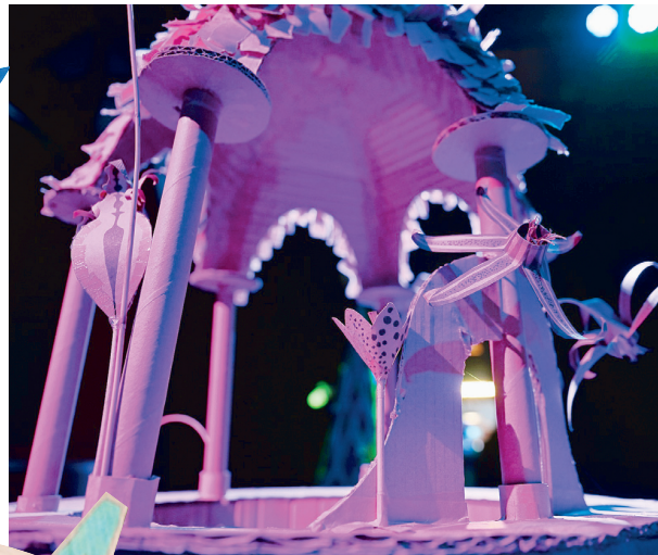
The installation part of the Strange Garden. 561881_07