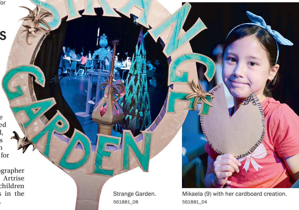
Strange Garden. 561881_08

Star Weekly photographer Damjan Janevski visited Artrise on Wednesday 1 July as children created their own pieces in the Strange Garden workshop.