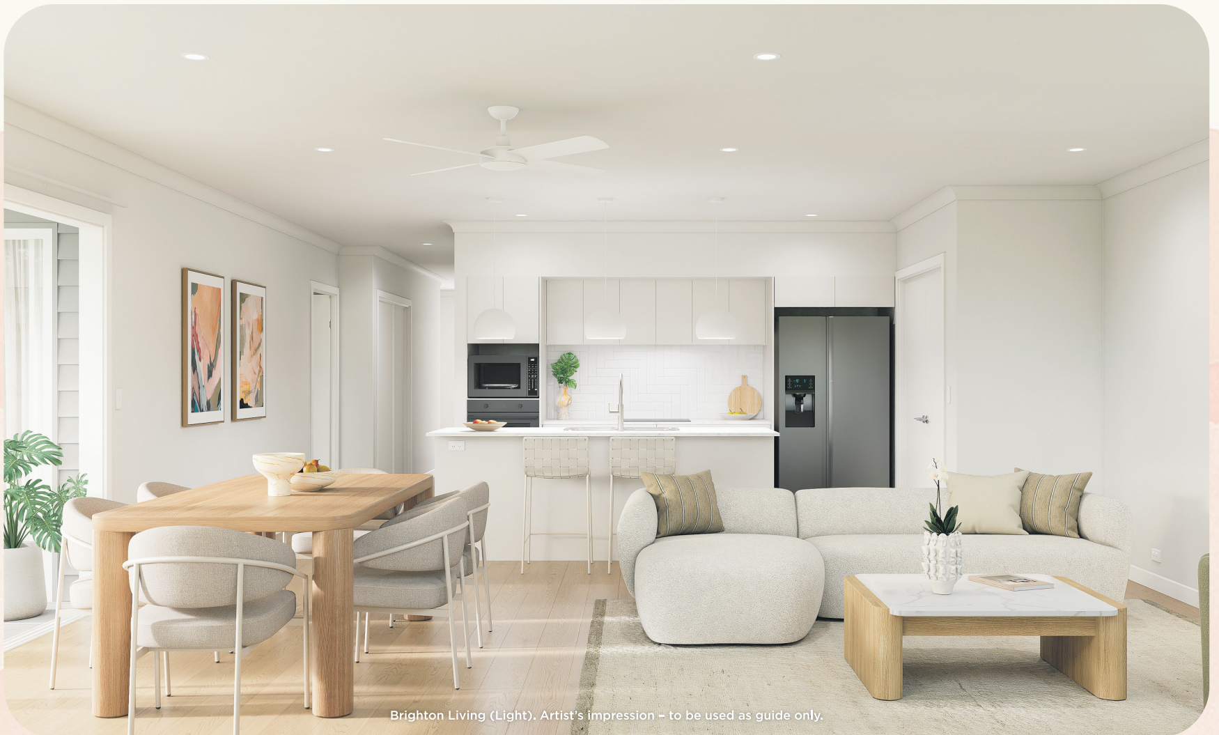
Brighton Living (Light). Artist's impression – to be used as guide only.

Resort-style living designed for over 55s