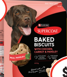
Supercoat Baked Biscuit Treats 400g Selected Varieties $1.25 per 100g