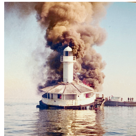
The Gellibrand Pile Light fire on the morning of 23 June, 1976. (Laurie Dilks)

Sadly, like the rest of the structure, it was also damaged beyond repair and given its