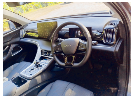
BYD looks to be on a real winner with its Sealion 5.

The 2.7-metre wheelbase together with the underfloor battery location provides excellent rear seat space.