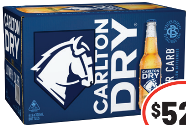
Carlton Dry Range Stubbies 330mL