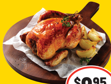
Regular Hot Roast Chicken