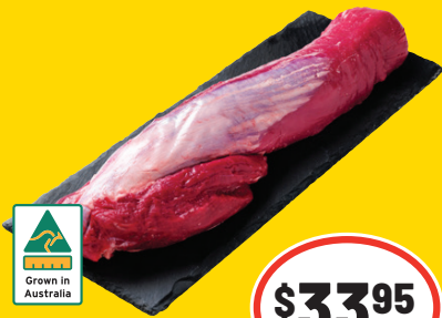
Australian Whole Economy Beef Eye Fillet