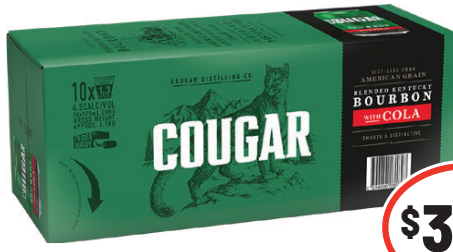
Cougar & Cola 4.5% Premix Cans 375mL