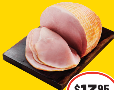
Champagne Ham Sliced or Shaved $1.40 per 100g