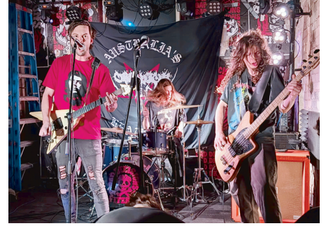
Melbourne thrash outfit Electric Funeral will headline Metal Against War at Mama Chen's in Footscray on 20 June.

Details: https://mammachens.com.au/26-06-20-metal-against-war/