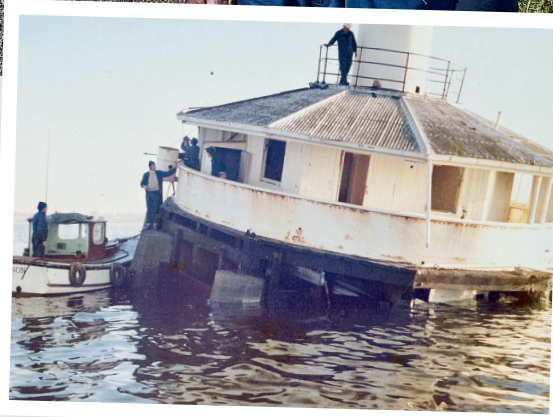
Right: Workers prepare the damaged pile light to be burnt. (Laurie Dilks)

fiery end, they don't explain how it came about; how the state government of the day found itself in the extraordinary position of having to set fire to a beloved historic landmark.