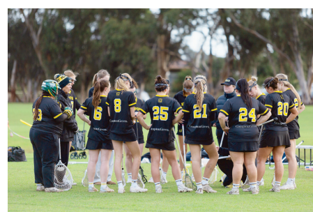
Newport watches on. 559195_04