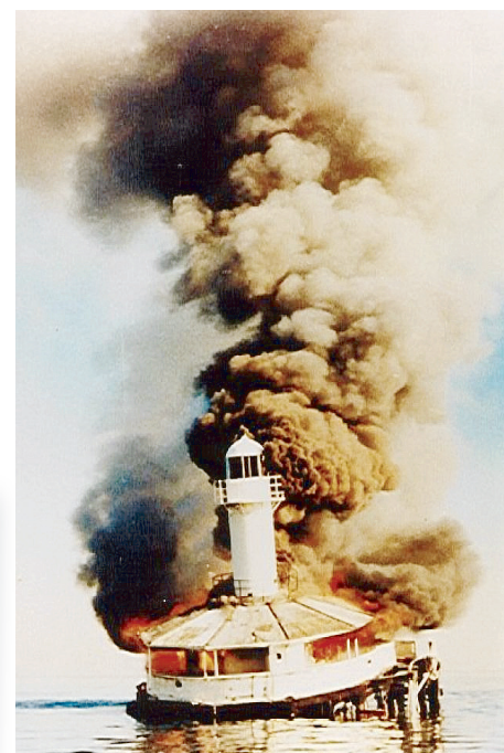
Laurie Dilks took this photo of the burning pile light from a boat 25 metres away. (Laurie Dilks)

importance to nearby shipping lanes, it had to be removed and replaced as soon as possible.