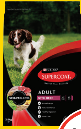
Supercoat Smart Blend Dry Dog Food 6.7-7kg Selected Varieties