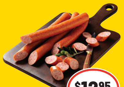
Don Kabana $1.30 per 100g