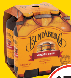
Bundaberg Drinks 4x375mL Selected Varieties $3.67 per Litre