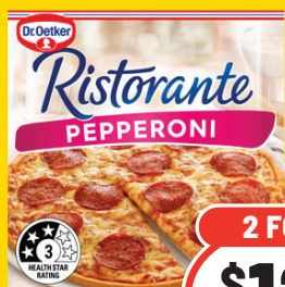
Dr. Oetker Ristorante Pizza 310-390g Selected Varieties