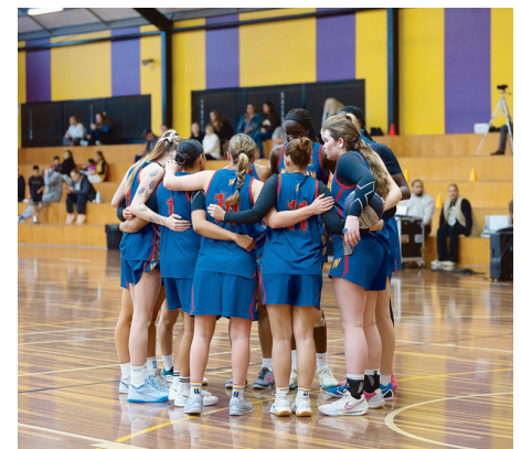
Wyndham women's team. 559190_01