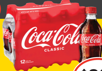
Coca-Cola, Sprite or Fanta 12x300mL Selected Varieties $2.76 per Litre