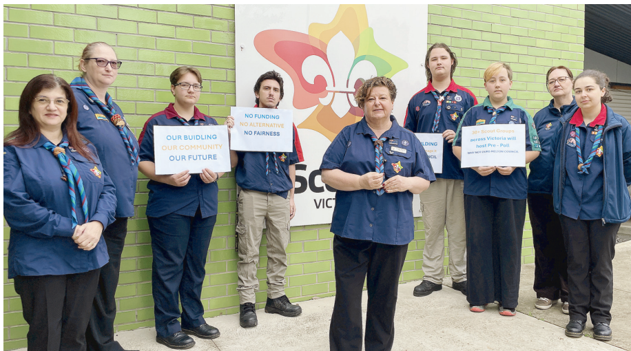
The First Caroline Springs Scout Group is pushing back against council's decision to use its scout centre as a pre-poll voting location.

She also highlighted the facility is owned and managed by Scouts Victoria, not council, and said both Scouts Victoria and