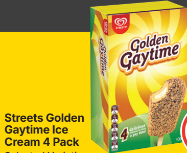
Streets Golden Gaytime Ice Cream 4 Pack Selected Varieties $1.24 per 100mL