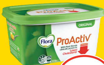
Flora ProActiv Spread 450-500g Selected Varieties